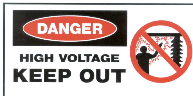
Figure C1 Danger sign for L, K and R type kiosks

Caution 2. Danger signs must not be attached in any position where drilling for the attachments, or fixing of the attachments, could possibly endanger the person attaching the sign, or any other persons, or cause damage to the equipment in the kiosk substation.