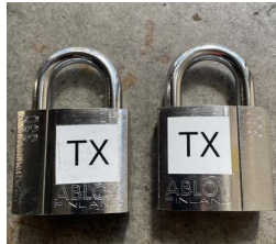
Table B3 Fuse and fuse cartridge stockcodes

Note: Consistent marking as per below picture must be included on the Z15 padlock.