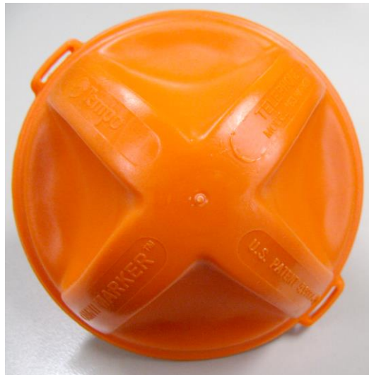
Figure 1 - Example of a telecommunications omni-directional frequency based marker device